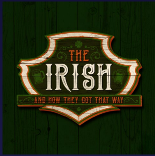
THE IRISH AND HOW THEY GOT THAT WAY Feb. 28 - March 16, 2025