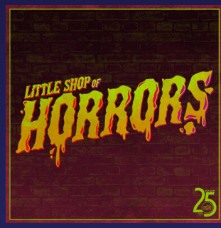
LITTLE SHOP OF HORRORS June 6 - 29, 2025