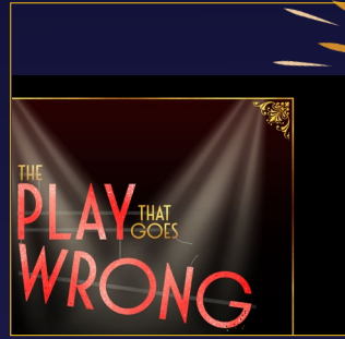
THE PLAY THAT GOES WRONG March 28 - April 19, 2025