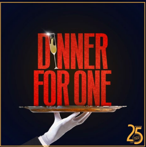
DINNER FOR ONE November 1 - 17, 2024