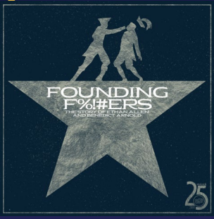
FOUNDING F%#!#ERS (EFFERS) May 2 - 18, 2025